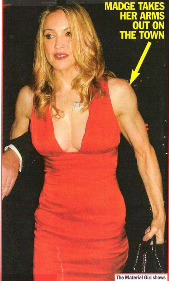
The Material Girl shows off her Olympic-worthy arms in London on Aug. 16, her birthday.